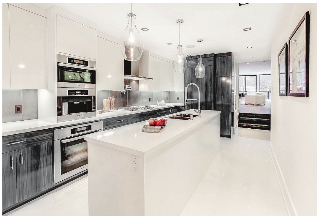
A historic façade and a modern interior come together in a perfect reflection of the area.